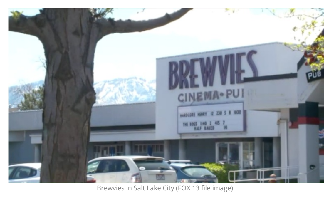
Brewvies in Salt Lake City

A spokesman for Utah Attorney General Sean Reyes told FOX 13 they were reviewing the decision and had not decided if they would go to the 10th U.S. Circuit Court of Appeals in Denver.