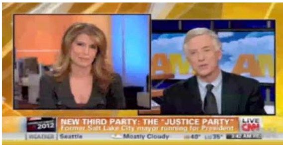
CNN Newsroom with Carol Costello CNN – December 13, 2011

Financial deregulation, the role of the Justice Party in American politics, lobbyists and bribery, the socialism misnomer, the National Defense Authorization Act, and the degradation of the legal system.