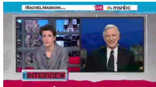
The Rachel Maddow Show MSNBC – November 30, 2011

Rocky and Thom discuss how to change the current political landscape, the democratization of communication, the Supreme Court's activism, pharmaceutical lobbyists' impact on the cost of care, why the Democratic Party can't be changed, and Americans' desire for better choices in politicians.