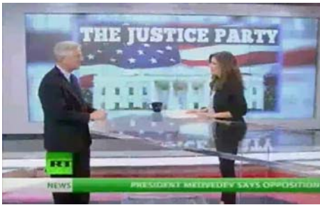
The Alyona Show RT Television – December 14, 2011

Guests Rocky Anderson, Amy Goodman, and Eleanor Clift discuss media bias in election coverage, Ron Paul, following the money in public policy, the Occupy movement, the paradox of embedded journalists' purpose, economic disparity, the prison-industrial complex, the gatekeepers of information, and voter suppression.