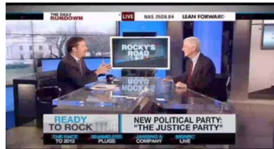
The Daily Rundown with Chuck Todd MSNBC – December 12, 2011