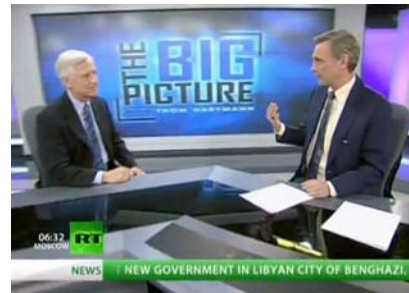
The Big Picture with Thom Hartmann RT Television – December 15, 2011