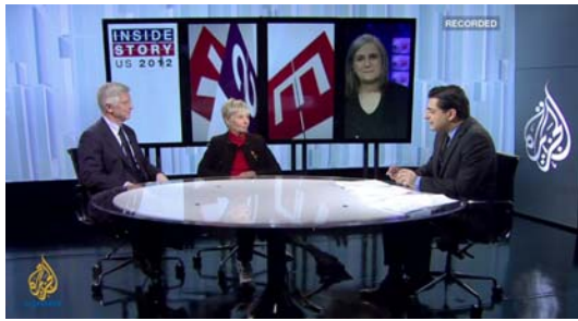
Inside Story: US 2012 Al-Jazeera – December 29, 2011

Guests Rocky Anderson, Amy Goodman, and Eleanor Clift discuss media bias in election coverage, Ron Paul, following the money in public policy, the Occupy movement, the paradox of embedded journalists' purpose, economic disparity, the prison-industrial complex, the gatekeepers of information, and voter suppression.