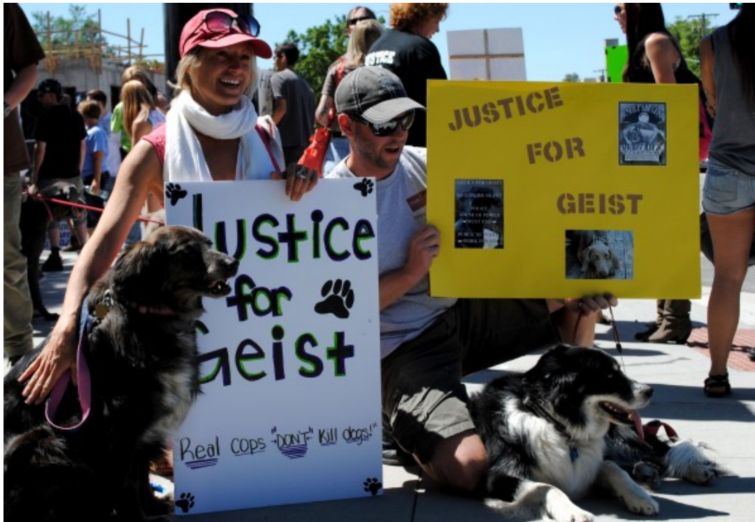
Real cops don't kill dogs.