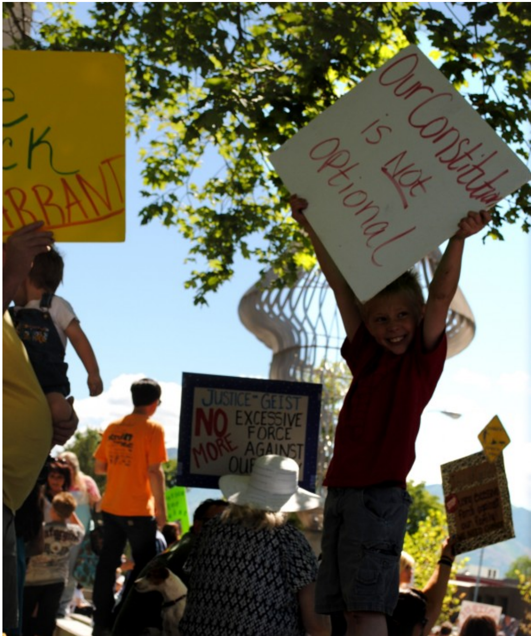
"Our Constitution is not optional."