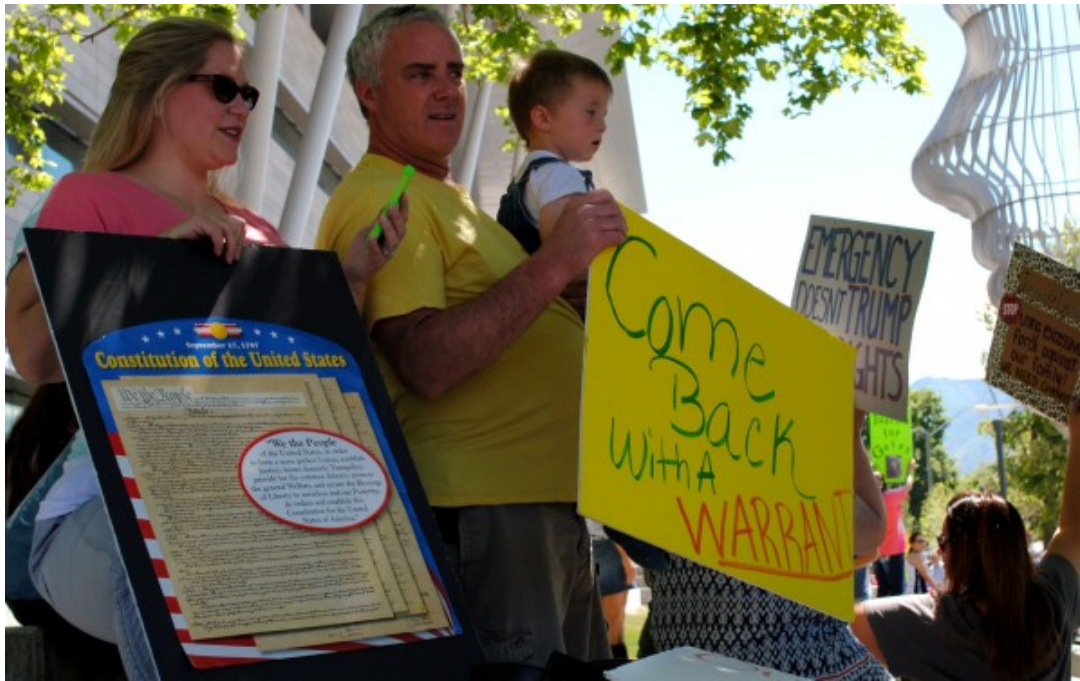
"Come back with a warrant"