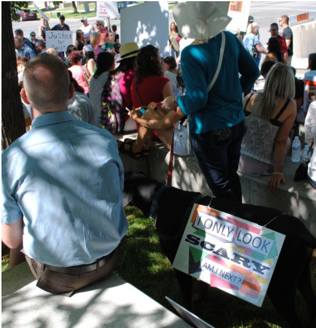
I only look scary. Am I next?