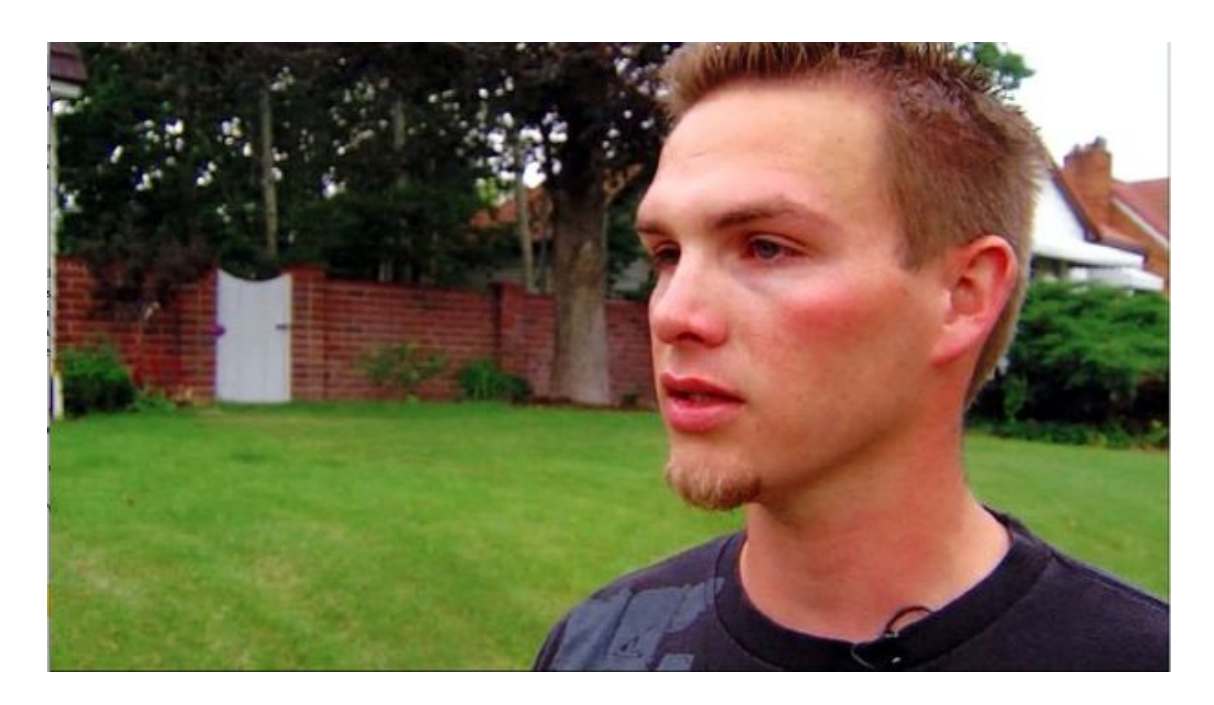
Federal appeals court sides against owner of Geist, dog killed by police