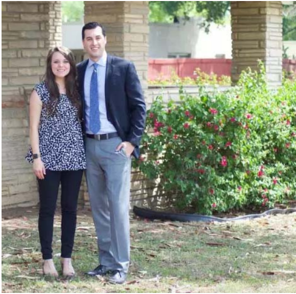
Jinger Duggar Is Still Freaking Fans Out With Her... (6)