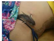
OMG: Catfish Sticks Tourist's Stomach While Swimming Off Coast Of Brazil