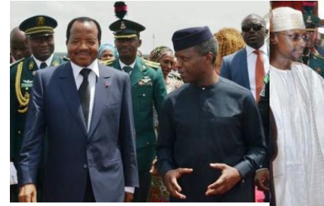
Photos Of Cameroon President, Paul Biya Arriving In Nigeria