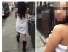
Man Makes Wife Walk Naked After Catching Her Message Other Men