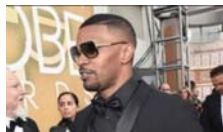
Singer And Actor Jamie Foxx Pulls Man From Burning Car After Terrifying Crash